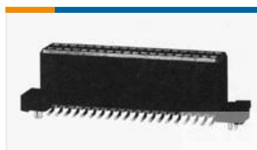
TE Part # 147378-9 24 SYS50 SMT RCP DR SHD W/O HD