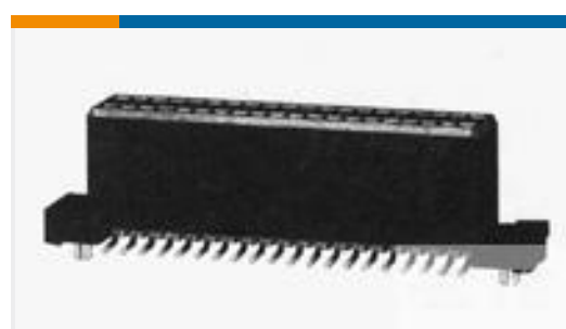
TE Part # 104550-3 24 SYS50 SURFMNT DRST RCPT